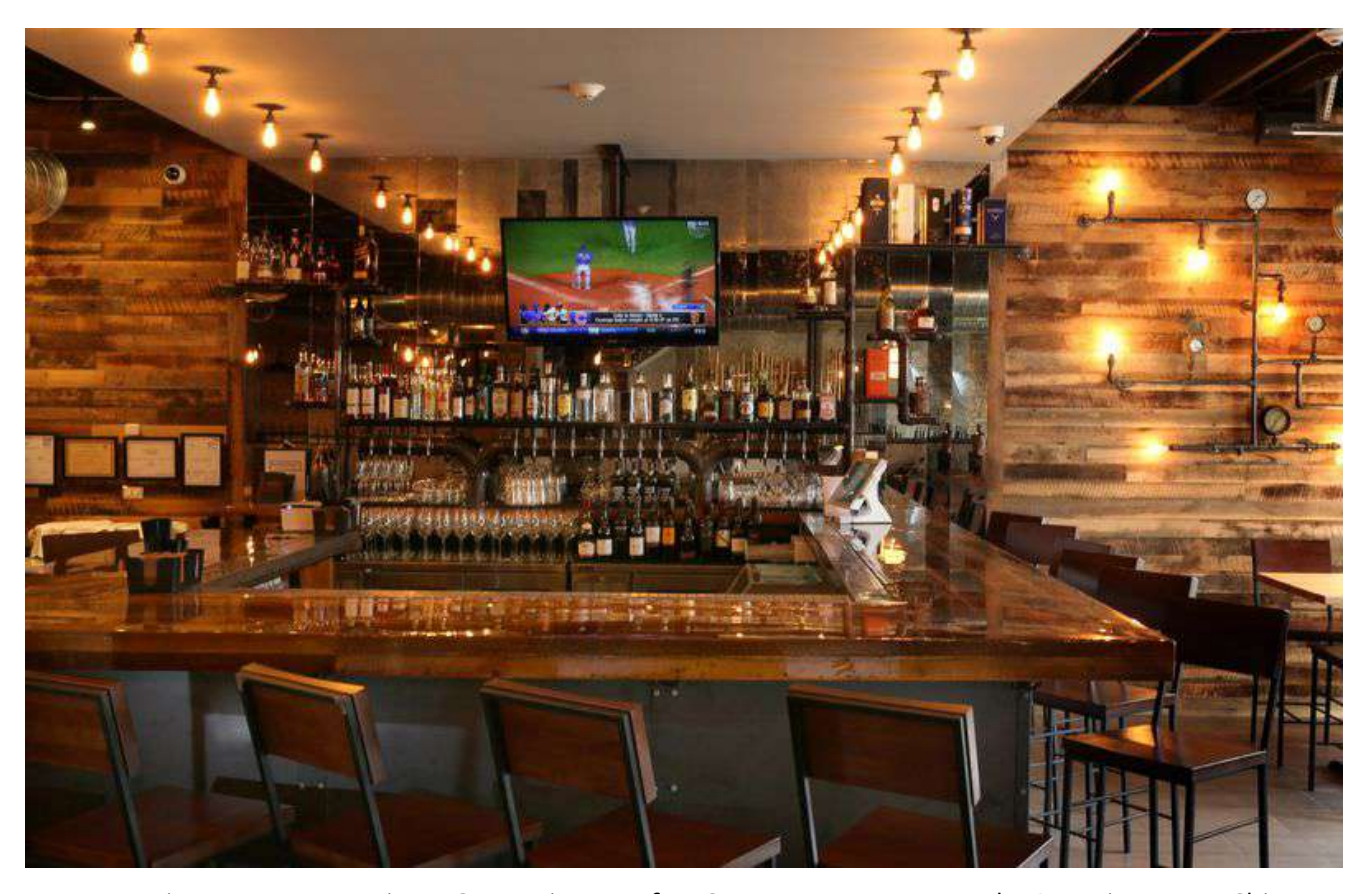
Fourteensixteen restaurant in La Grange is part of La Grange Restaurant Week.

d chicagotribune.com/dining/ct-food-restaurant-week-suburbs-0221-20200221-ljlsoygyczgw5iomseaixhas5u-By Phil Vettel